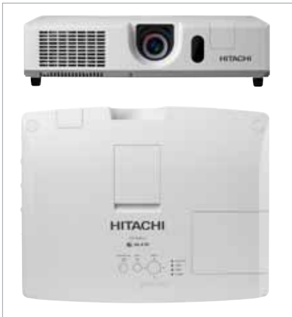
Aspect Ratio 4:3