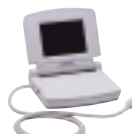
: LCD-5500 You can preview your presentation.