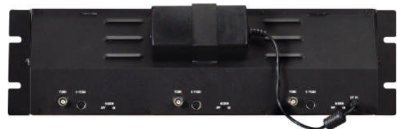
LM-563R Rear with PS Mounted